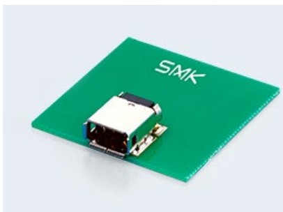
Receptacle : CRS5001-4701F