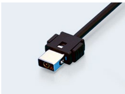
Plug : CRC9001-7701F