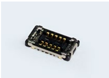
Socket : CPBE7□□-0101F