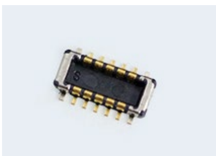
Plug : CPBE8□□-0101F